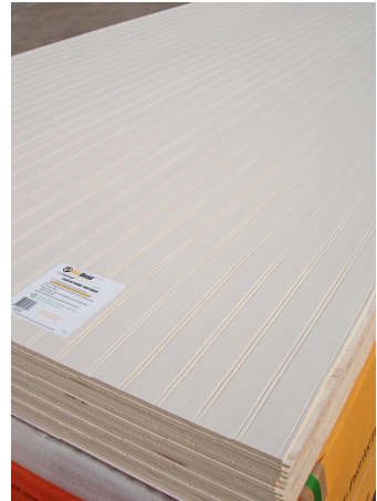
1.6" V-Bead pattern on the reverse side, primed and ready to use